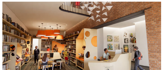
Tree House Books now owns their property in North Philadelphia and has renovation plans as depicted in this artist's rendering.